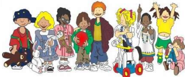
Whispering Pines Preschool

Whispering Pines Preschool 395 N Grand St. Cobleskill, NY 12043