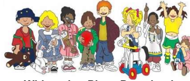
Whispering Pines Preschool

Whispering Pines Preschool 395 N Grand St. Cobleskill, NY 12043