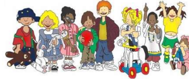
Whispering Pines Preschool

Whispering Pines Preschool 395 N Grand St. Cobleskill, NY 12043