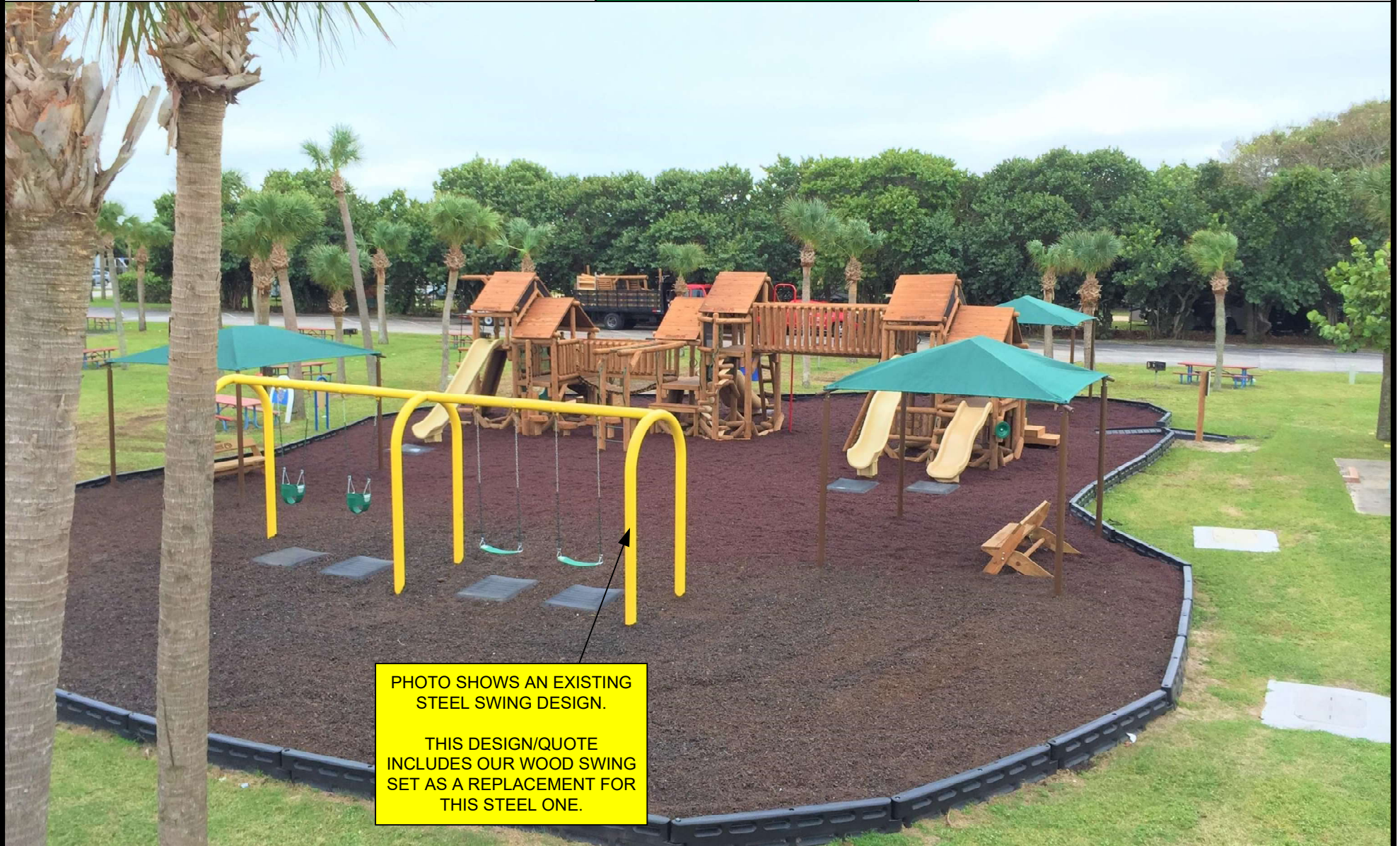
PHOTO SHOWS AN EXISTING STEEL SWING DESIGN.

Not all equipment may be appropriate for all children, even when designed for a target age group. To avoid injury you should closely supervise and participate in the child's use of this equipment, especially while learning to use it. Proper supervision is required.